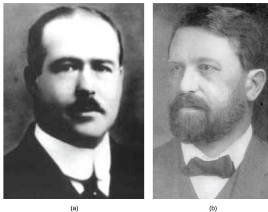
Figure 13.2 (a) Walter Sutton and (b) Theodor Boveri developed the Chromosomal Theory of Inheritance, which states that chromosomes carry the unit of heredity (genes).

The speculation that chromosomes might be the key to understanding heredity led several scientists to examine Mendel's publications and reevaluate his model in terms of chromosome behavior during mitosis and meiosis. In 1902, Theodor Boveri observed that proper sea urchin embryonic development does not occur unless chromosomes are present. That same year, Walter Sutton observed chromosome separation into daughter cells during meiosis ( Figure 13.2 ). Together, these observations led to the Chromosomal Theory of Inheritance , which identified chromosomes as the genetic material responsible for Mendelian inheritance.